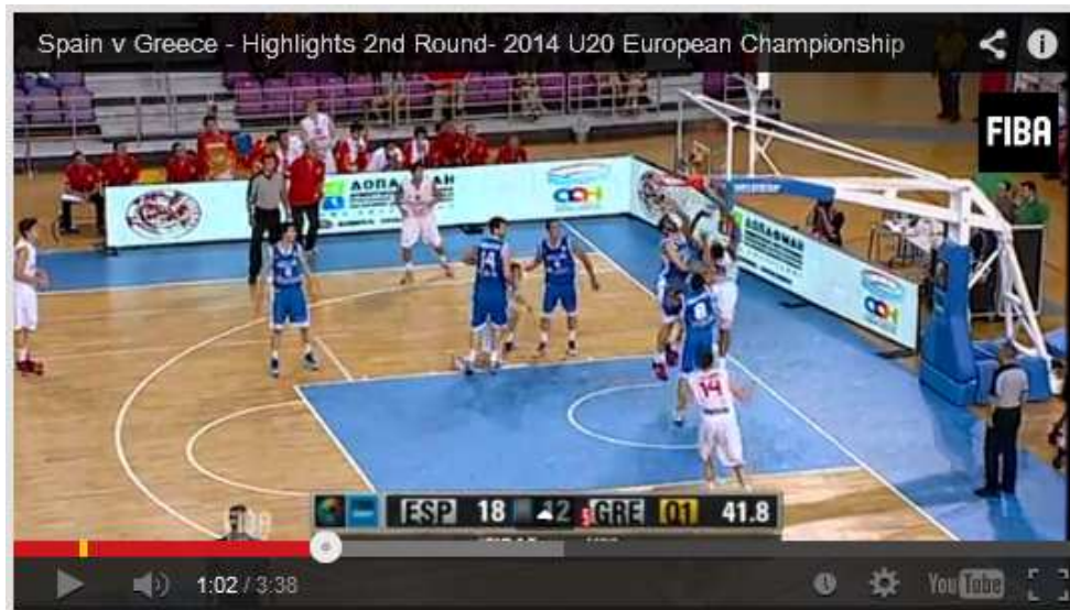
2014 FIBA U20 European Championship men – Greece