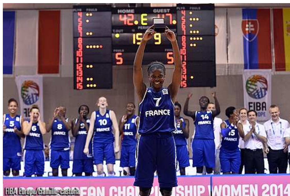
2014 FIBA U20 European Championship women – Udine - ITALY